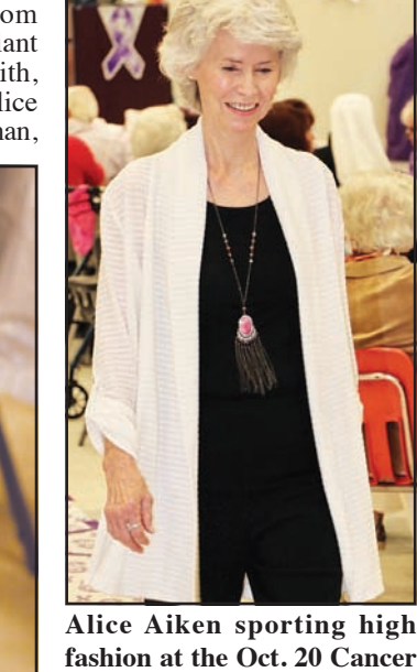
fashion at the Oct. 20 Cancer Survivors show inside the Blairsville Civic Center.