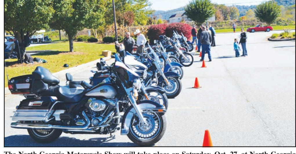
The North Georgia Motorcycle Show will take place on Saturday, Oct. 27, at North Georgia Technical College.

being provided by several of the show's sponsors. For a full list of sponsors and for more information on the show visit http://dennisbradley.com motorcycle/index.html.